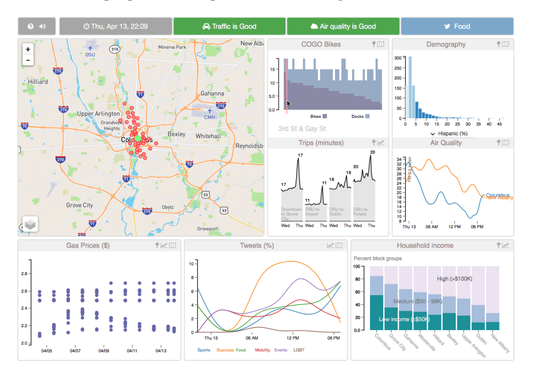
Figure 1: The front page of the dashboard.

We design the dashboard as the front page of a web site called CURIO (Columbus Urban & Regional Information Observatory)<sup>8</sup>. Figure 1 shows the overall interface of the dashboard in a web browser. The top of the screen is a summary computed using the data about transportation, environment, and social aspects of the city. The largest panel shows the base map, along with maps made from other data sets. Figure 1 also shows examples of interactivity within a plot panel (COGO Bikes): when the user moves the cursor through the bar chart, the plot shows the name of the bike sharing station, which is also highlighted as the green dot on the map.