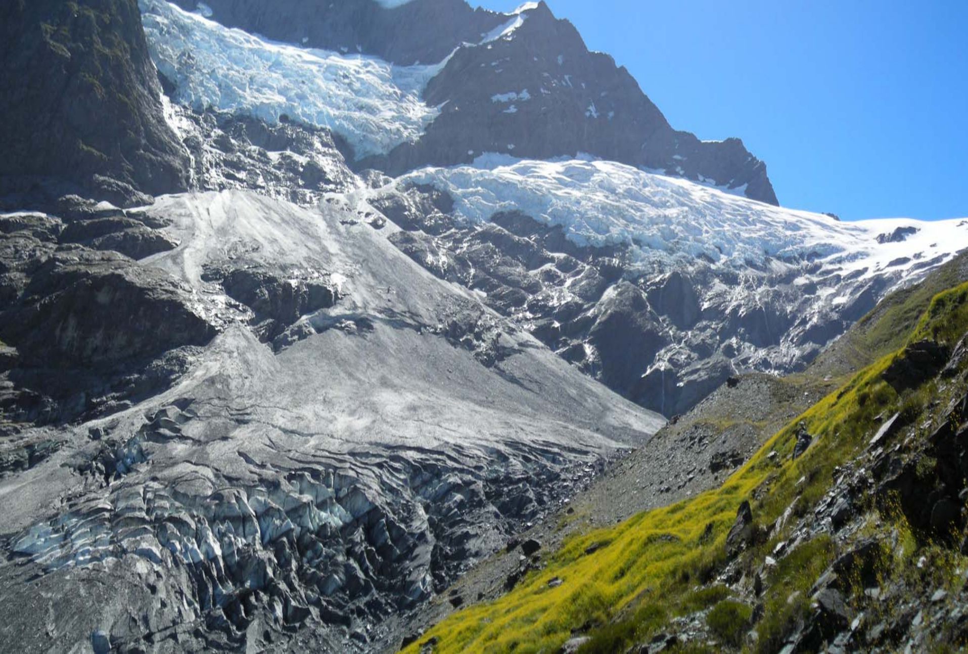
Rob Roy glacier