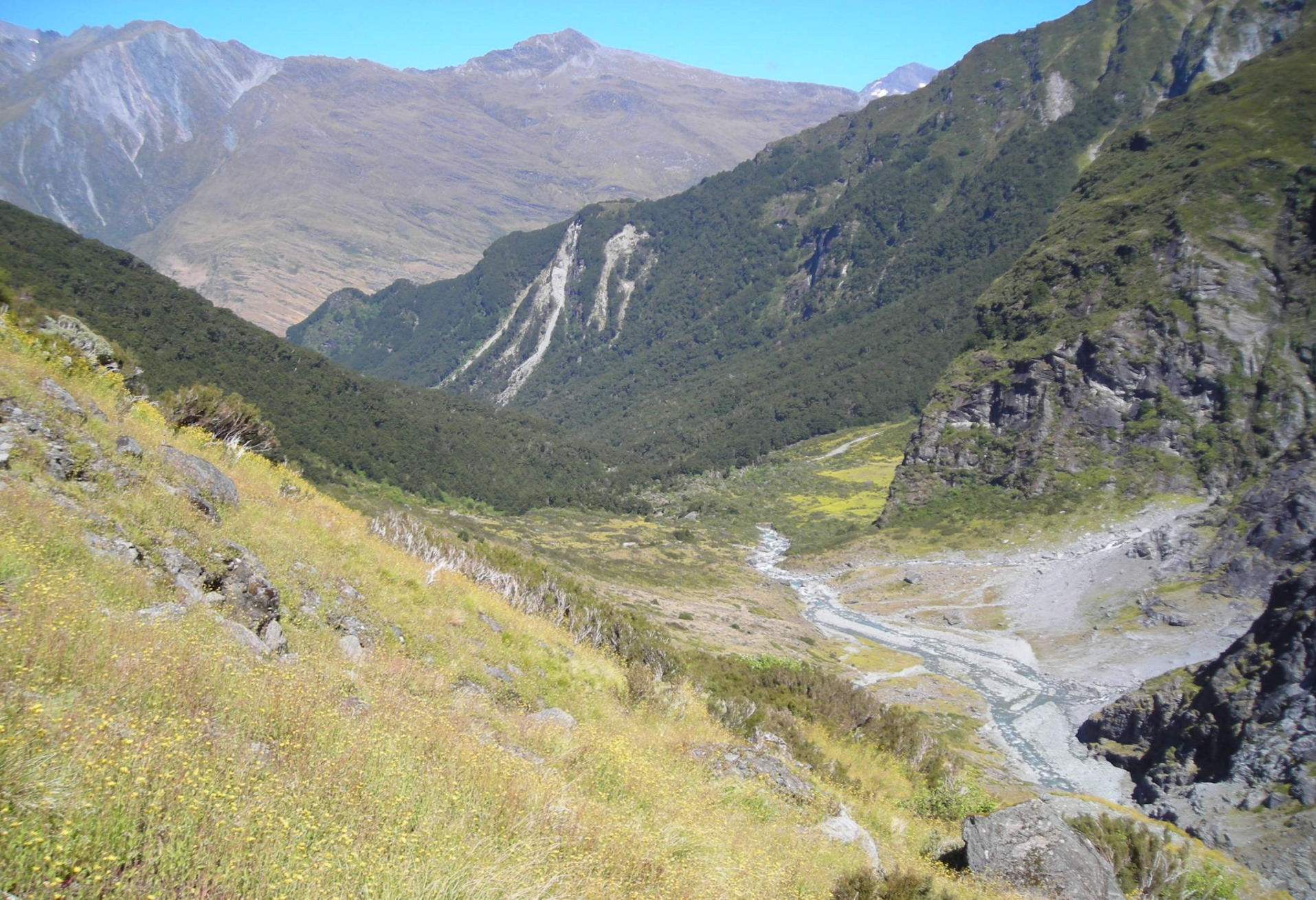
Small outwash area in front of Rob Roy glacier