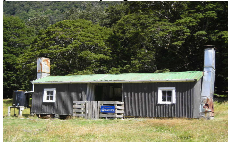
Mt Aspiring Hut, and Cascade Hut, both in upper west Matukituki valley