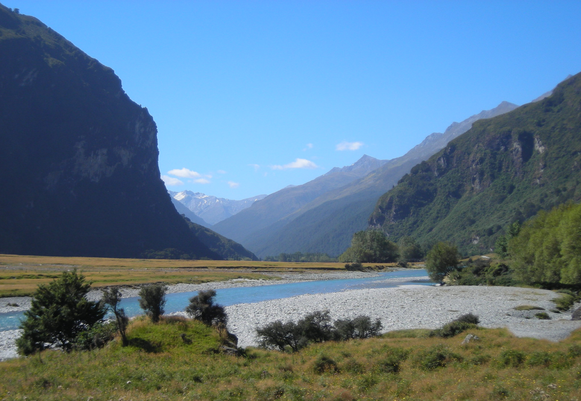
Matukituki valley, view east, from near Raspberry Creek parking