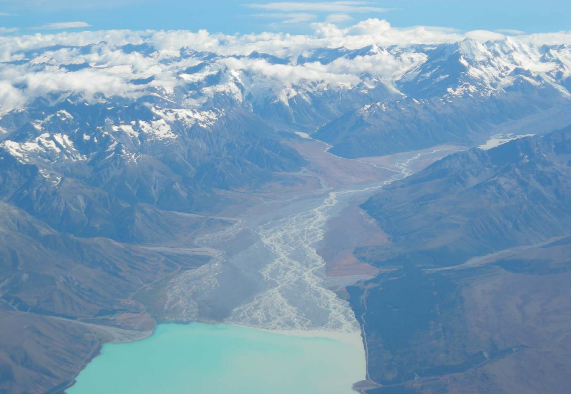
Aerial view of the head of Lake Pukaki, towards Mt Cook / Aoraki