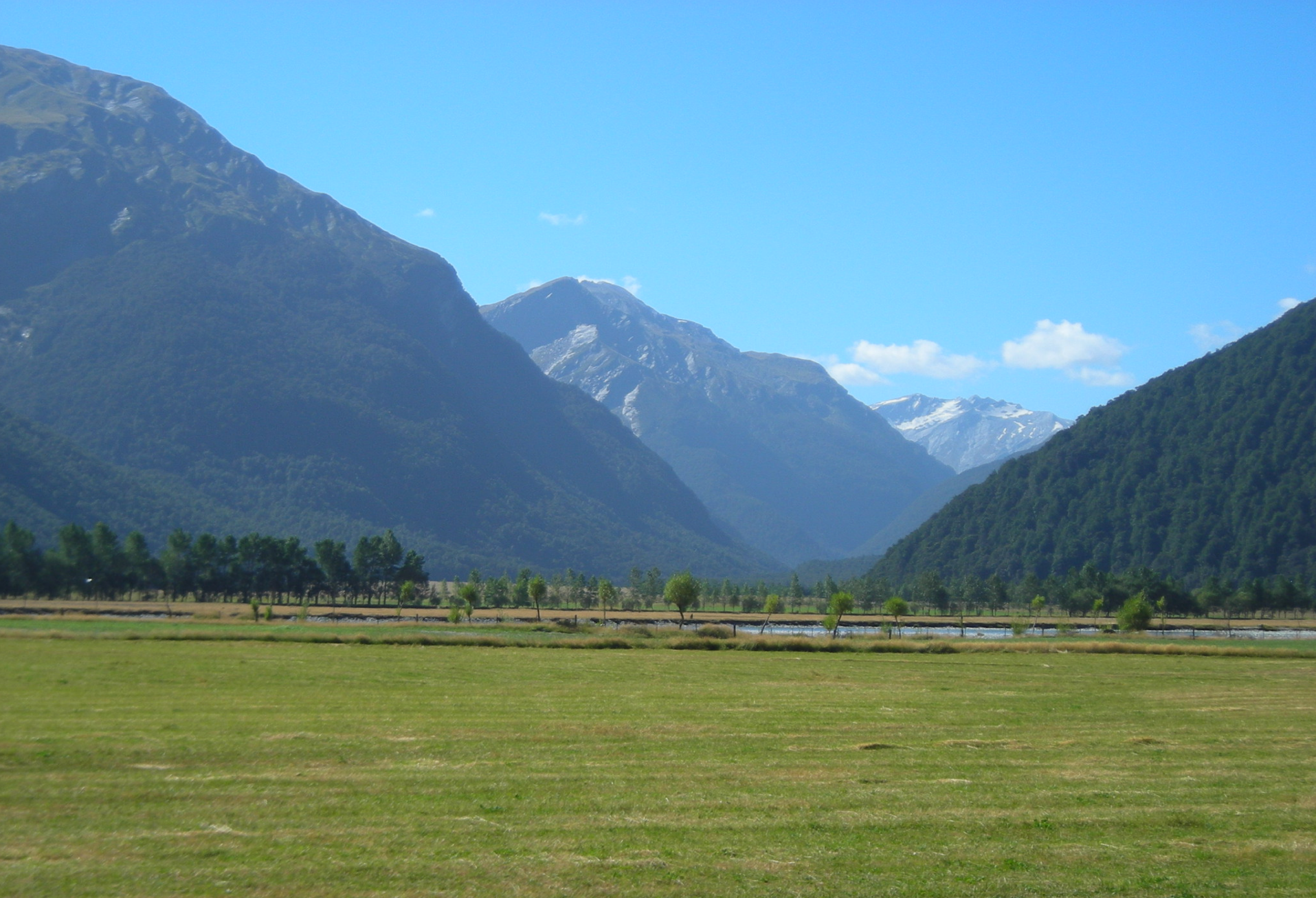
Cameron Flat. View north into the east Matukituki valley