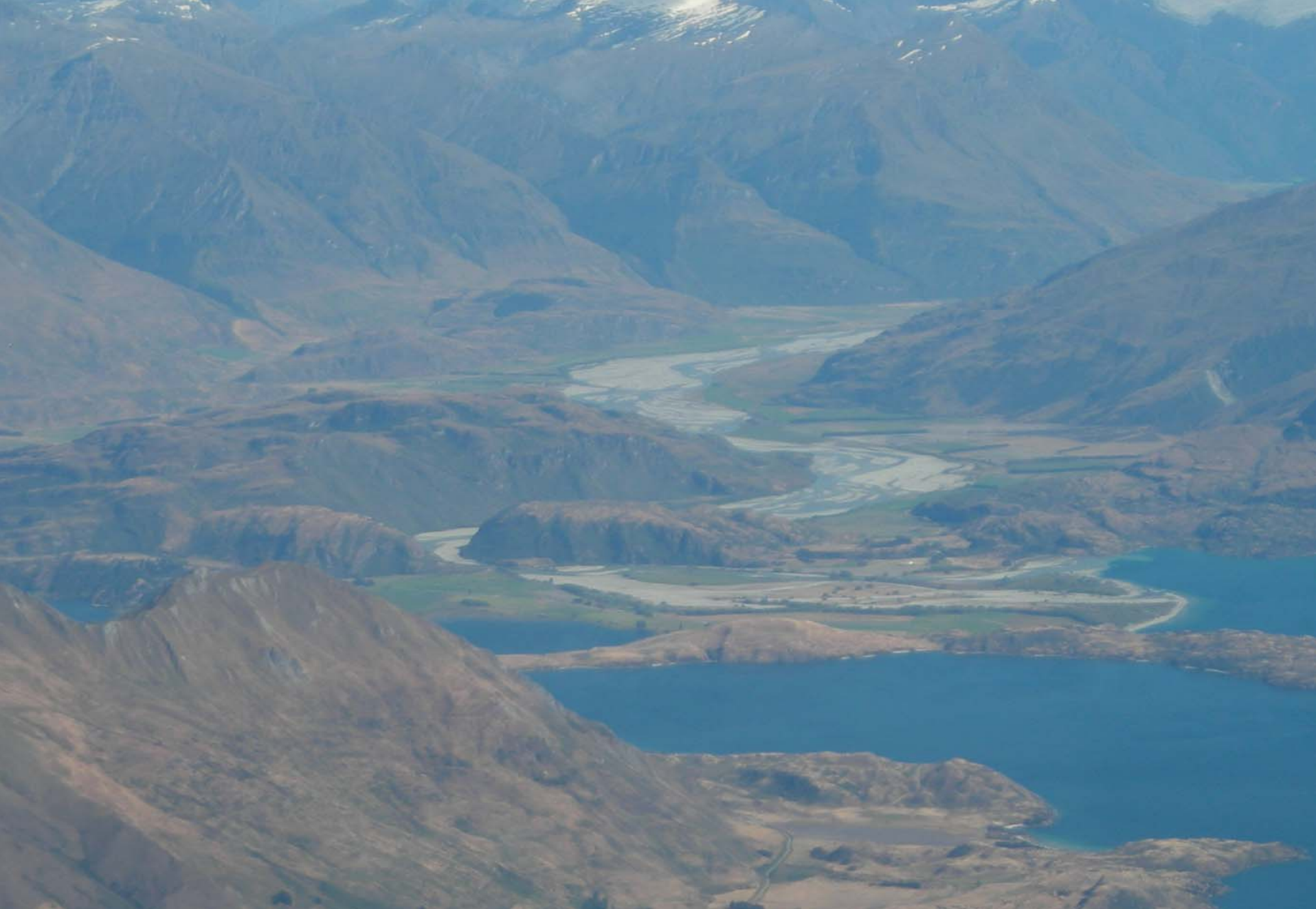
Aerial view of the mouth of the Matukituki valley