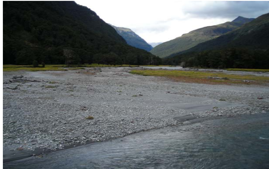
East Matukituki valley