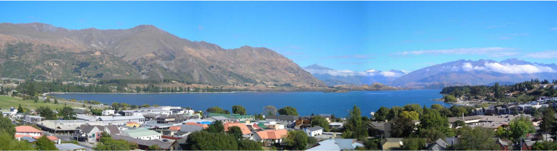
Lookout view of the head of Lake Wanaka, towards Mt Aspiring National Park