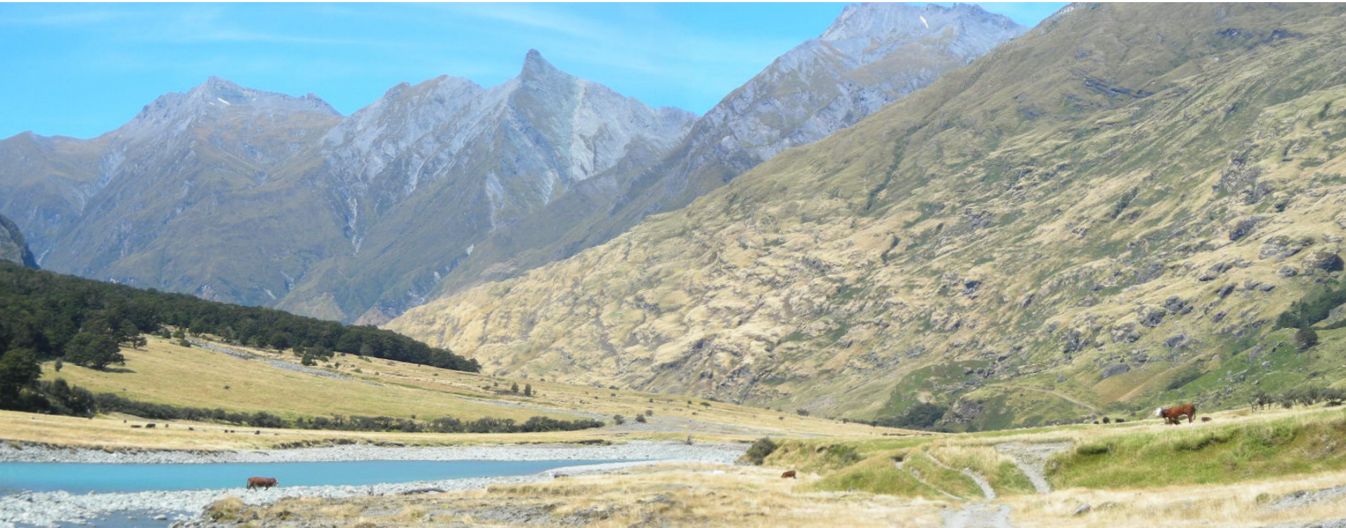
View east along the west Matukituki valley