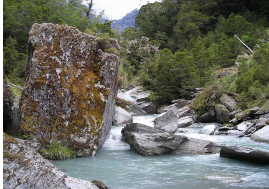
Glacier Burn, a tributary to east Matukituki valley