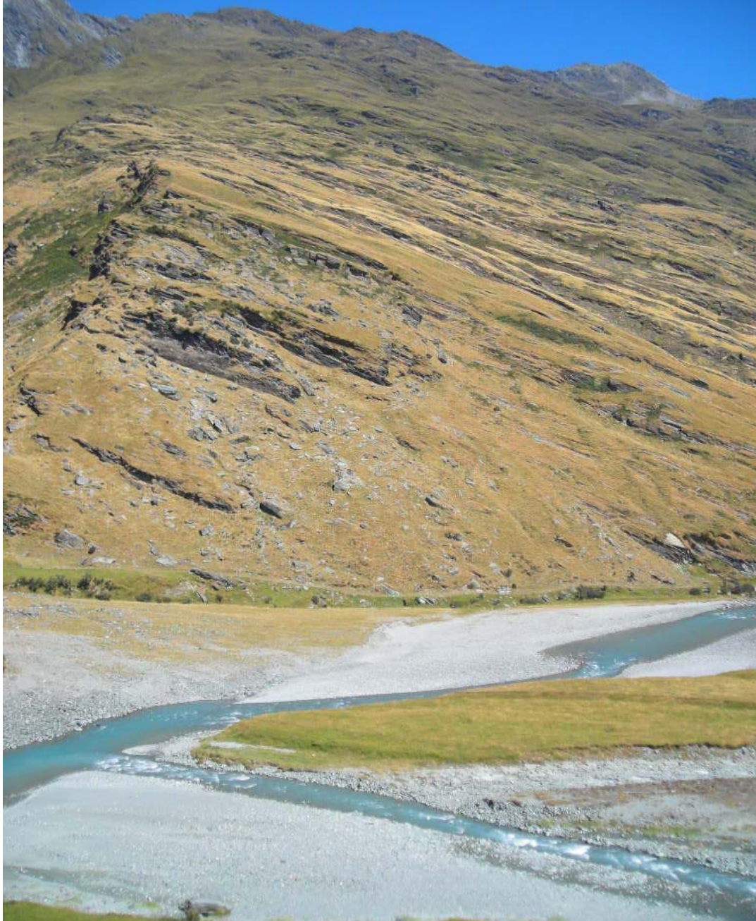
Typical landscape of the west Matukituki valley. Note track on opposite bank