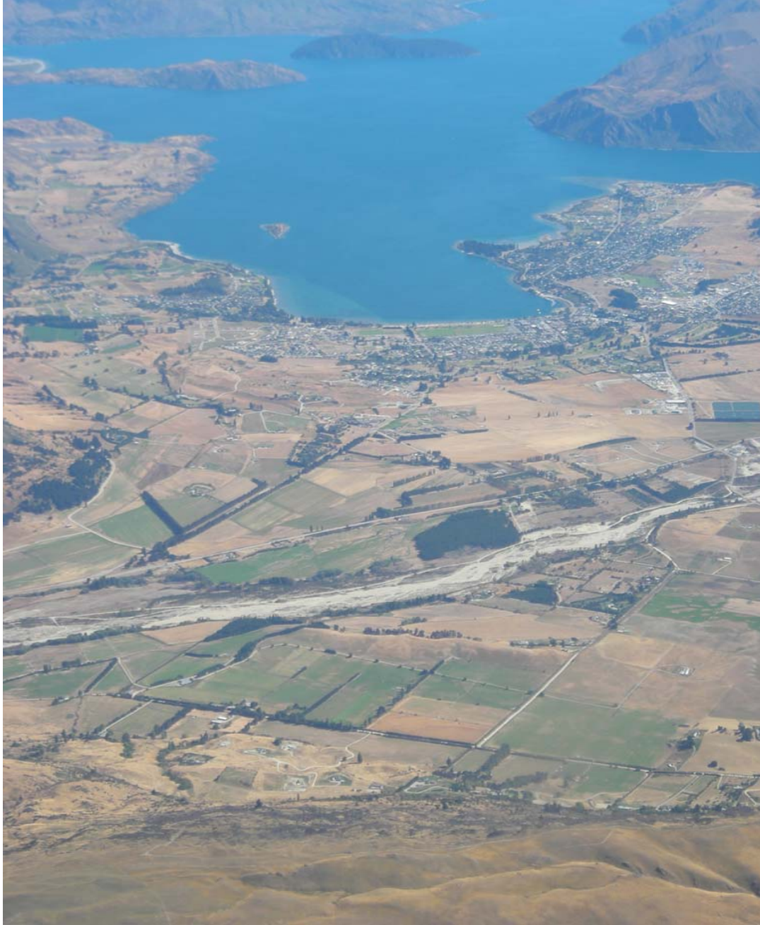
Aerial view of lower Lake Wanaka and Wanaka township