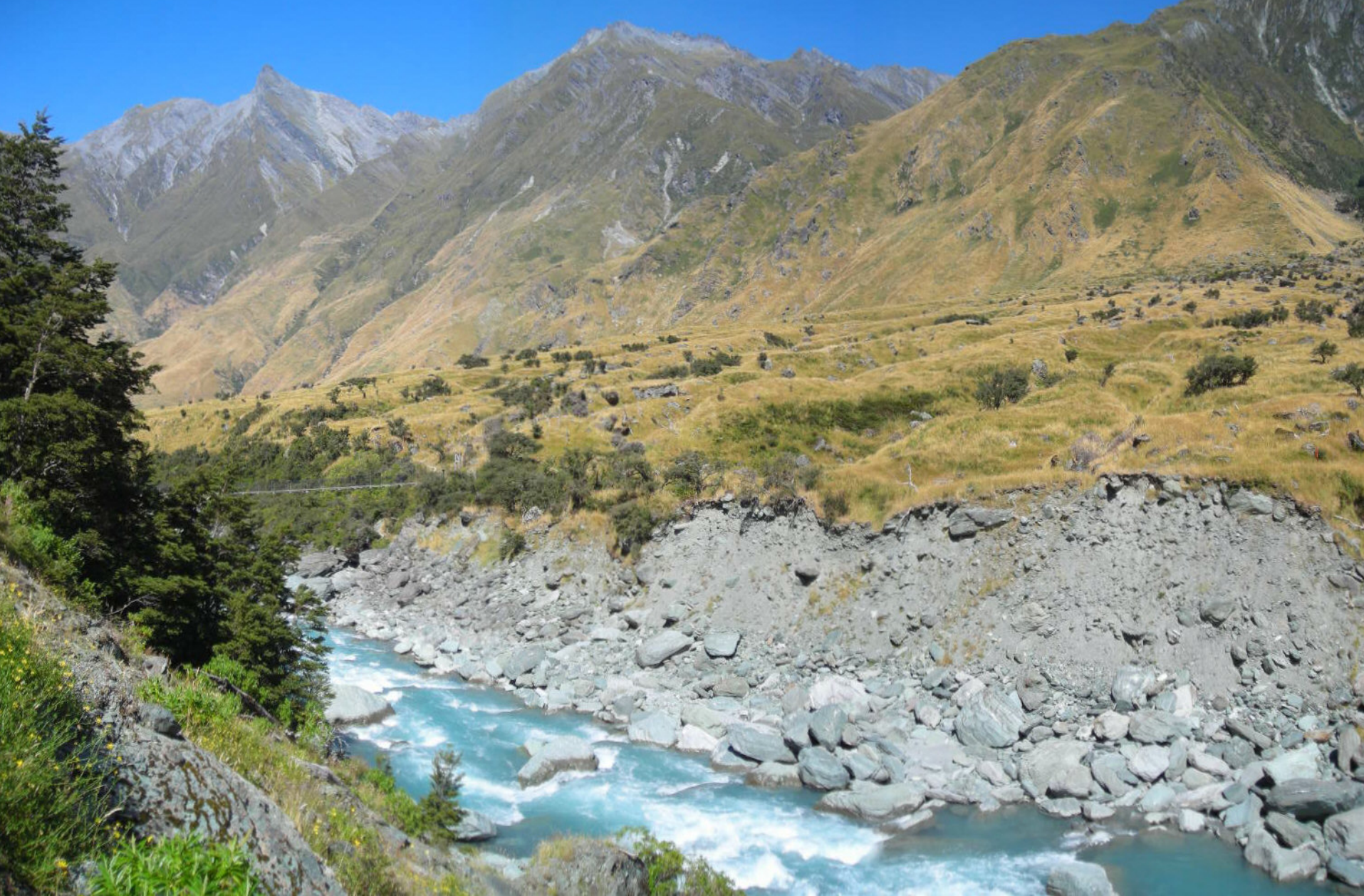
The Rob Roy valley swing bridge about 10mins from Raspberry Creek parking