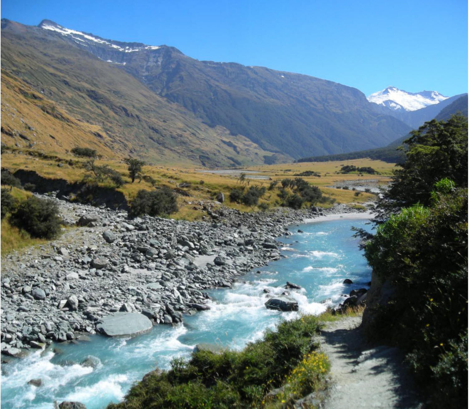
View up the west Matukituki valley, from the Rob Roy valley track