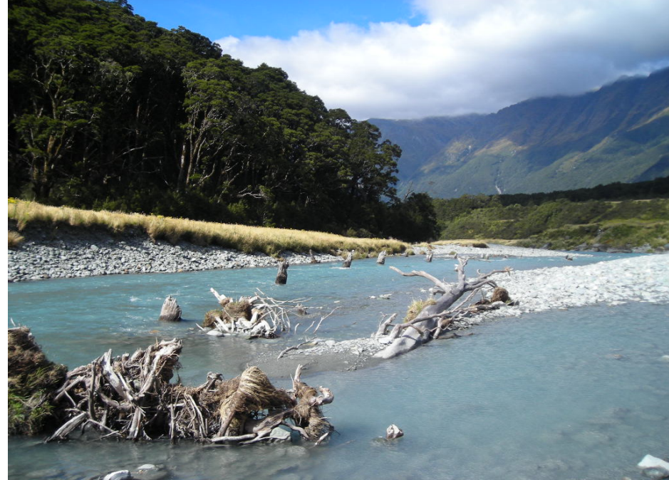
The upper west Matukituki valley becomes heavily vegetated