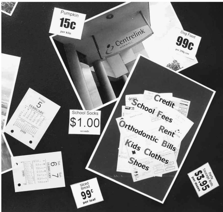
Fig. 3. A sole parent's story (detail).

familiar PAR approach the community researchers may have collected more stories and oral histories, and assembled these into a comprehensive account of the extent of social damage done to the Latrobe Valley. The photo-essays were, however, only a starting point. The