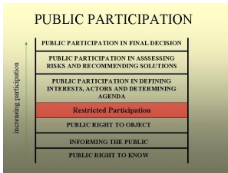
Figure 1. The public participation ladder

(1993) adapt this theory to their consideration of environmental decisions about hazardous waste management.