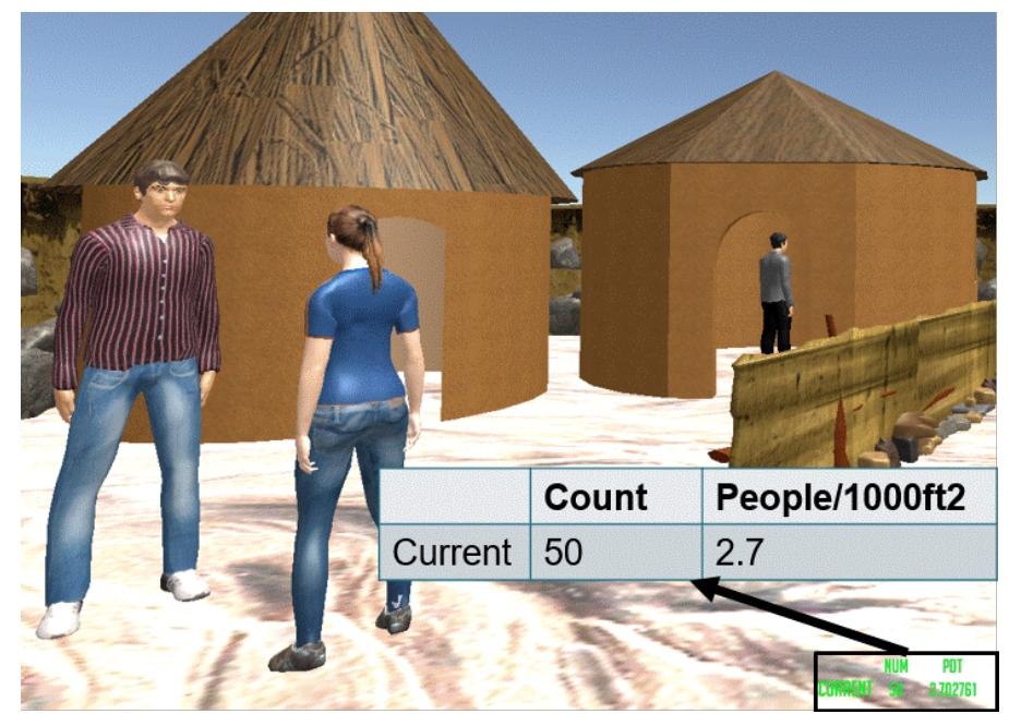
Figure 1: First person view of village scene with multiple structures (unfortunately POC does not yet represent local ethnicity and clothing customs/fashion).

For multi-building scenes (Figure 1), users control whether avatars can move in and out of the separate structures. While PDT is focused on interior density allowing a full scene to unfold improves the realism of the experience.